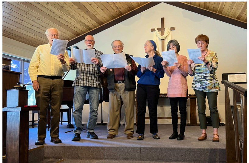
The Salish Singers delighted